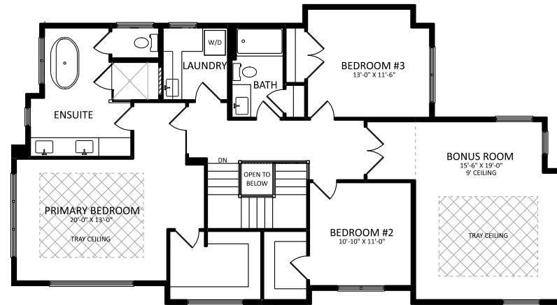
SECOND FLOOR 1490 SQ FT